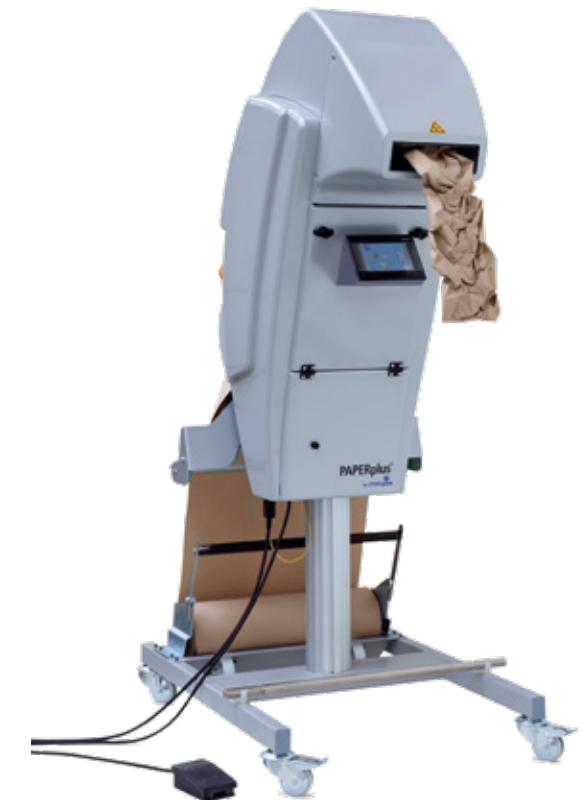
PAPERplus® Classic 2