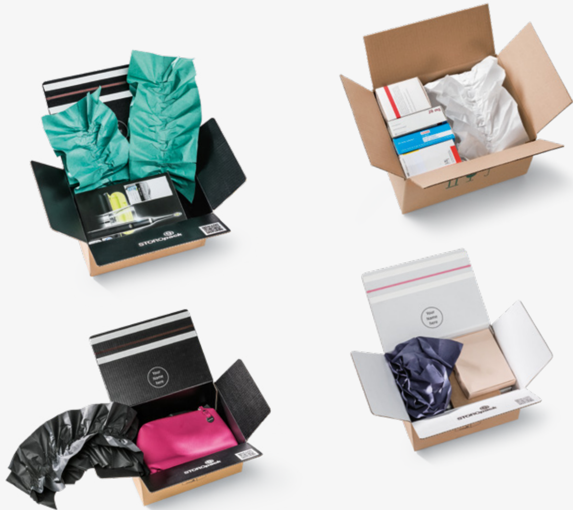
The compact solution for medium-weight to light items: PAPERplus® Papillon for void fill and wrapping