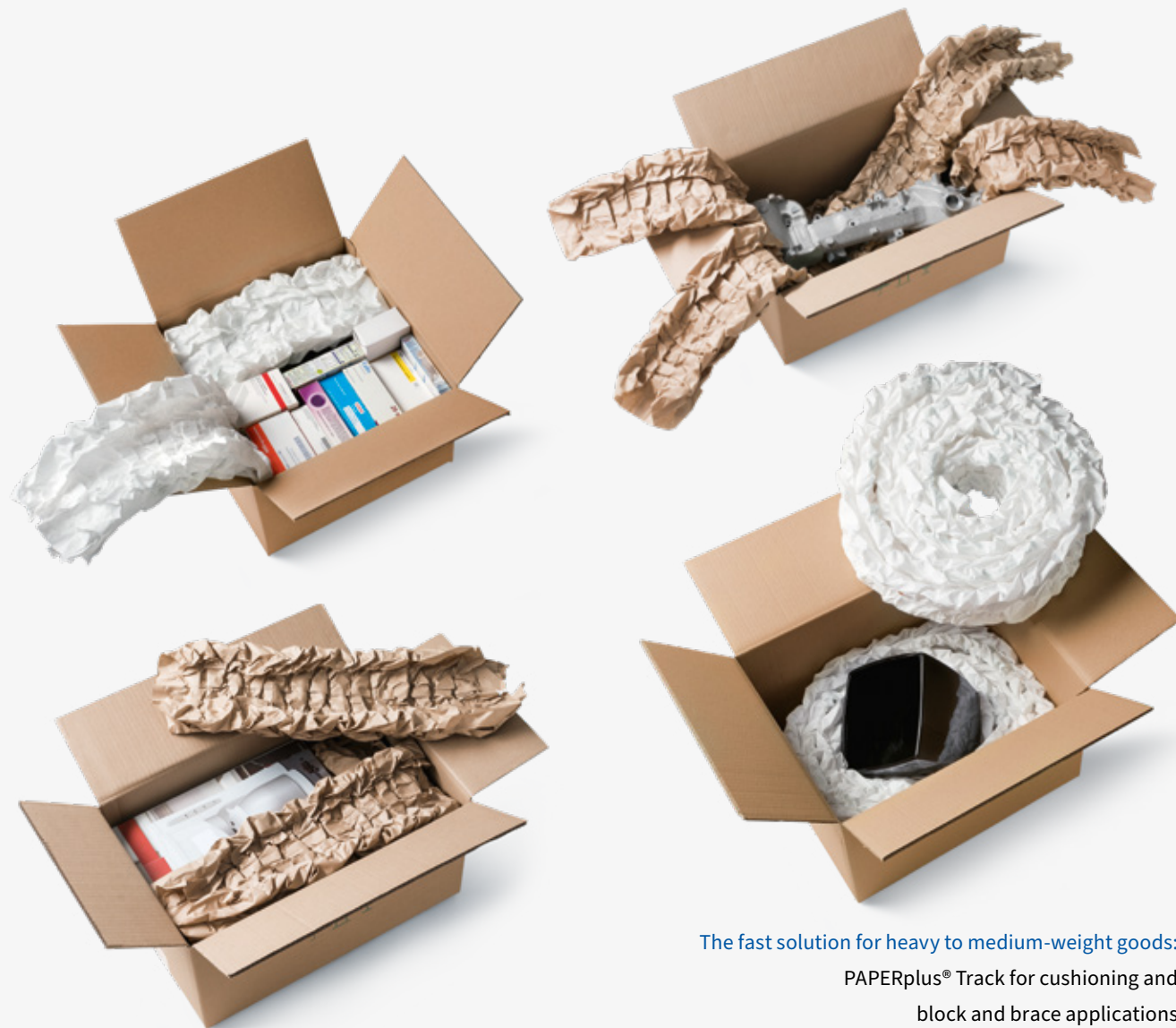
The fast solution for heavy to medium-weight goods: PAPERplus® Track for cushioning and block and brace applications