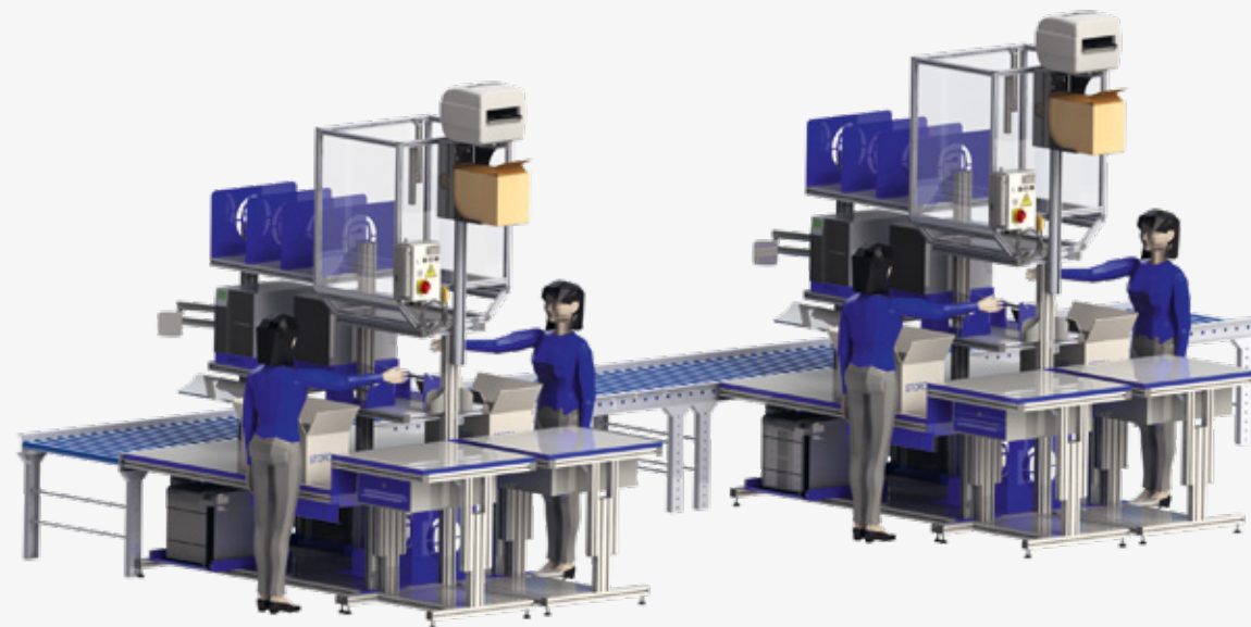
For comfortable and ergonomic work: Working Comfort® solution with PAPERplus® Papillon