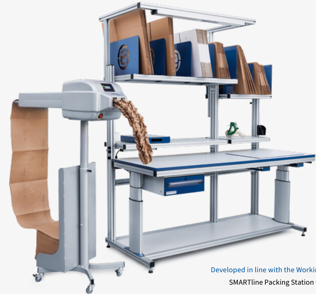
Developed in line with the Working Comfort® principle: SMARTline Packing Station with PAPERplus® Track

The focus here is on the efficiency of the processes and the well-being of your employees in equal measure: At the workstations, which are designed in line with the Working Comfort® principle; unnecessary tasks are eliminated and all packaging material is on hand for the packer.