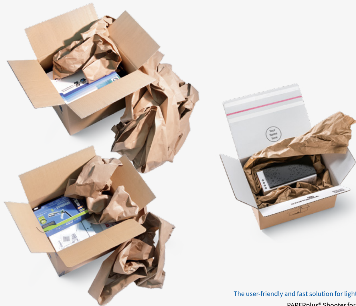
The user-friendly and fast solution for light goods: PAPERplus® Shooter for void fill

they're compact in size with an adjustable height and boast a rotating head and an automatic cutting device. The speed can be infinitely adjusted as required. Also, our customers can integrate the PAPERplus® Shooter into existing packing processes with the greatest of ease and produce paper cushioning directly at the packing station.