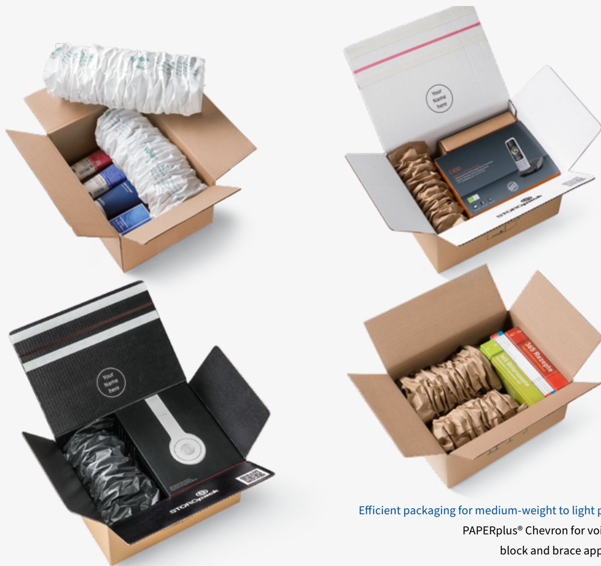
Efficient packaging for medium-weight to light products: PAPERplus® Chevron for void fill and block and brace applications