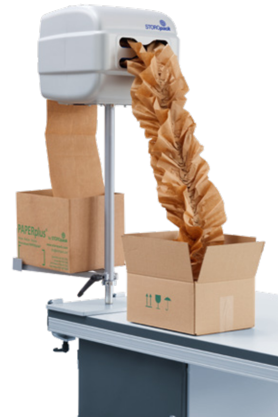
PAPERplus® Papillon Table Stand Model