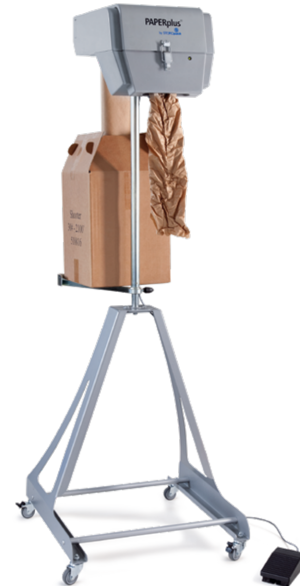
PAPERplus® Shooter Floor Stand Model