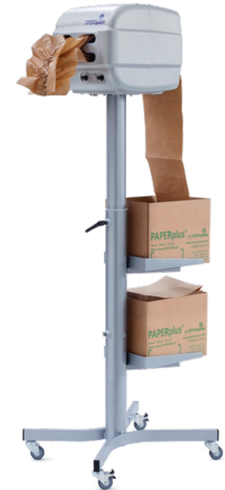
PAPERplus® Papillon Floor Stand Model

▶ PAPERplus® Papillon product video: www.storopack.com/paperplus-papillon-video