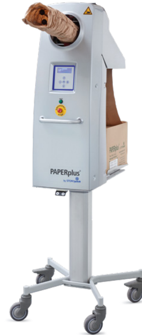
PAPERplus® Chevron 3